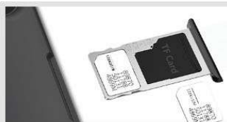
Dual LTE Network