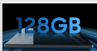
4GB LPDDR4X 128GB UMCP