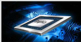
Mali G52 GPU